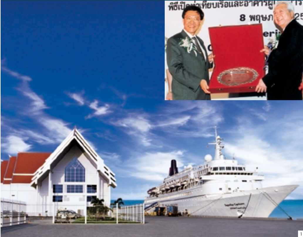
1) Star Cruises Terminal in Laem Chabang Opens The historic opening of the first world-class cruise terminal in Thailand on 8 May 2002 was graced by Thailand's Deputy Minister of Industry, Mr. Pichate Satirachawal who was the officiating guest-of-honour. Inset: Star Cruises' Chairman, President and CEO, Tan Sri Lim Kok Thay presenting a gift to Mr. Satirachawal.

The Star Cruises Terminal in Laem Chabang features a jetty with berth length of 265m, a passenger hall with a capacity to accommodate 1,500 persons, ample parking bay, air-conditioned departure hall, ticketing and check-in counters, food and beverage outlets, souvenir and duty-free shops, bus and taxi service and office space amongst others.